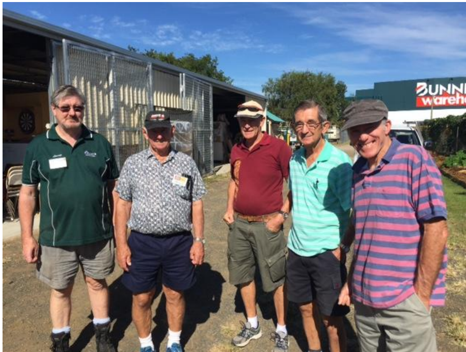
BRASSALL BAPTIST CHURCH MEN'S SHED VISIT US RECENTLY