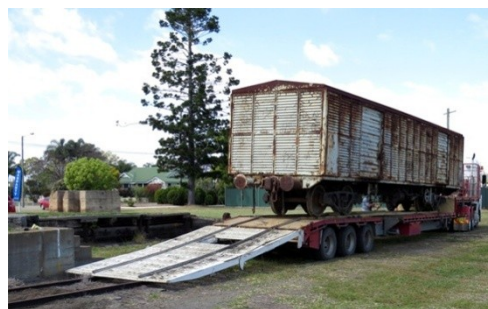
The first carriage, a wooden 1918 passenger car, came from Rockhampton followed by the steel freight carriage, which was transported from Gracemere