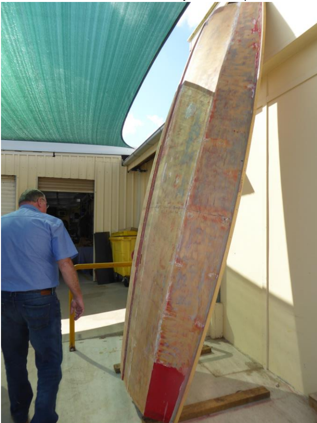
Space for Boat Building & repairs