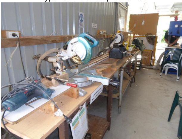
Drop saws located against outer walls of skillion with dust extractor outside.