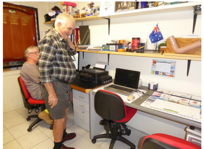
Well equipped and organised Office