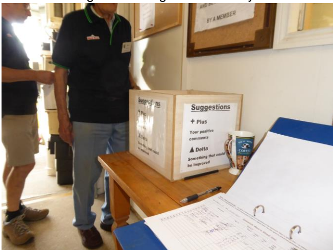
Suggestion Box – another good idea.