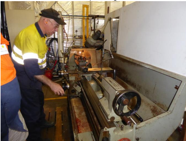
Metal Lathe – a few ex Railway Workshop members