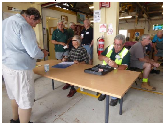
The sign in and pay table – a good idea