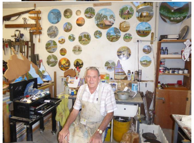
Picasso himself. Very creative artwork on old saw blades.