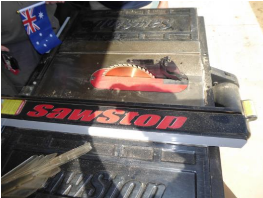
A hyper safe SawStop bench saw