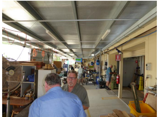
The covered skillion area is very large and functional