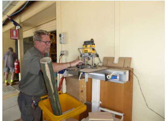
Very useful router