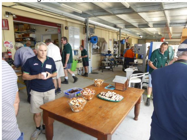
Smoko – Look at the spread

Ipswich Shed comprises four distinct functional areas. A separate office and cashier's room greet members upon arrival, flowing into the toy and art department, Off this room is the tool room with a repair area. Between this bay and the wood working area is the air conditioned computer and food preparation room. Between the wood working and Metal fabrication bays is the wood storage area. A skillion area has been secured by mesh gates which allows "dusty" activities such as sanding to be safely done. Outside the covered areas is a functional vegetable garden, with an ornamental garden, and storage area for trailers, steel, and bins (for sale). This is a truly functional model Men's Shed comprising about 90 members, a lot of whom have trades. We are very grateful for their ideas and support.