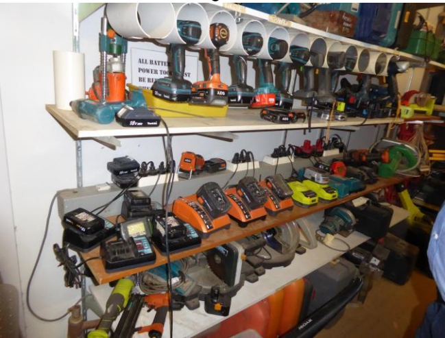
Very impressed with the drill & charger racks in the tool room.