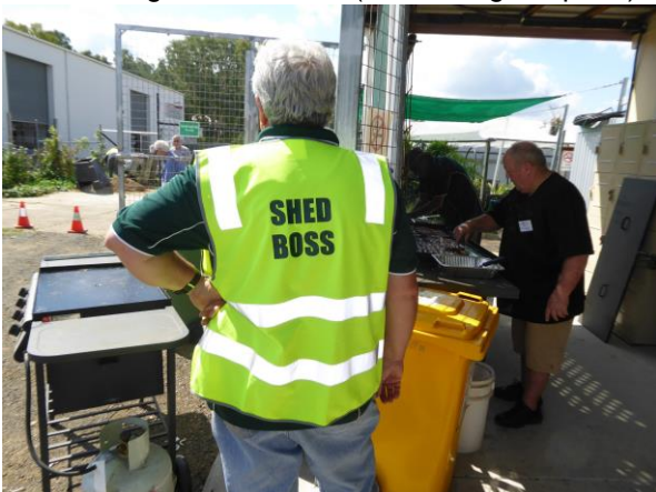
Shed Boss Hi Vis – Made in Ipswich. Necessary for Kenmore & Bellbowrie.