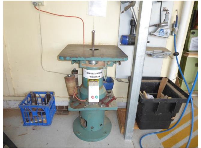
Large bobbin sander