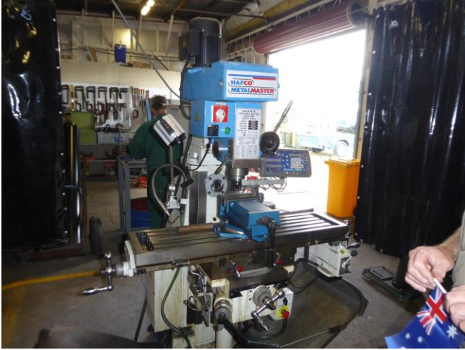
Metal Workshop Milling Machine