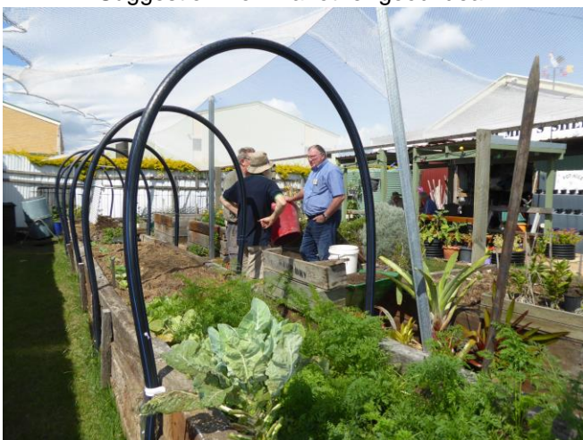
Amazing vegetable garden