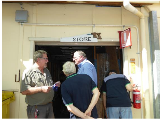
The Wood Store