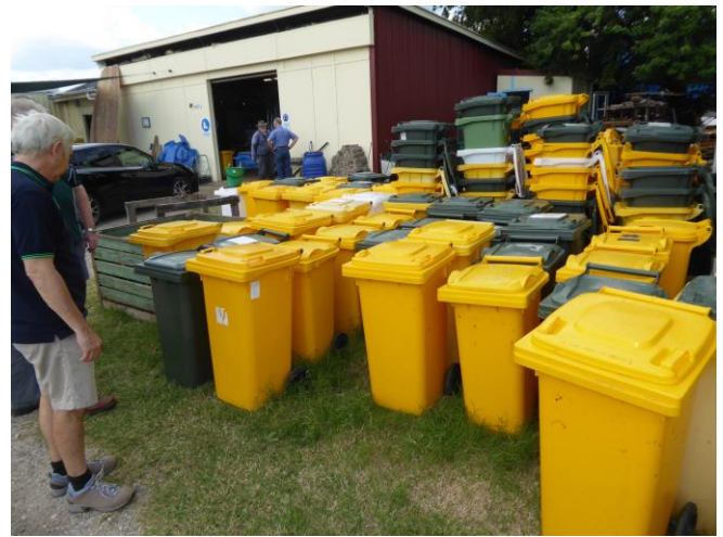
Paul Pisale, Ipswich Mayor, donated a huge number of unusable rubbish bins to the Shed, which they sell for $10 apiece. Wonder if we could approach BCC to see what they do with damaged or unusable bins? Have to think of storage – maybe Bellbowrie?