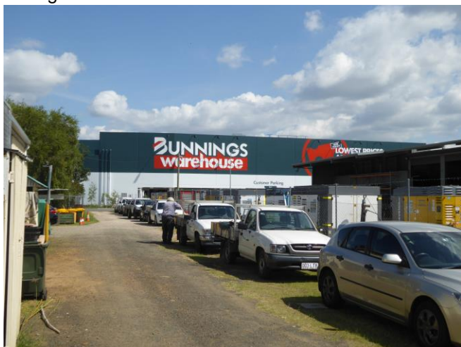
Bunnings across the road. Note Tradies utes.

Located at 3A Mining St, Bundamba, IMS approved Bunnings to move in over the road and their sausage sizzles are a major source of revenue for their Shed, apart from Bunnings sponsorships, a very tidy arrangement.