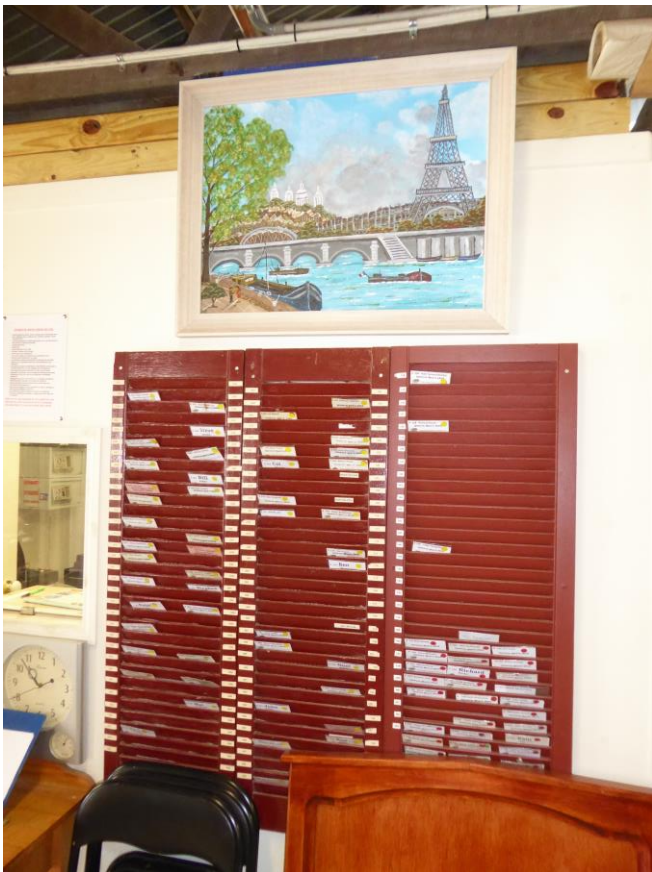
Name tag board – a good idea. Very visible.