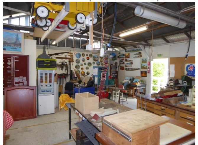
Art & Toy Making area