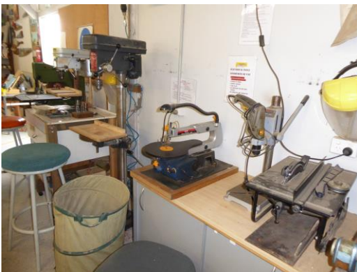
Scroll saws and drill presses