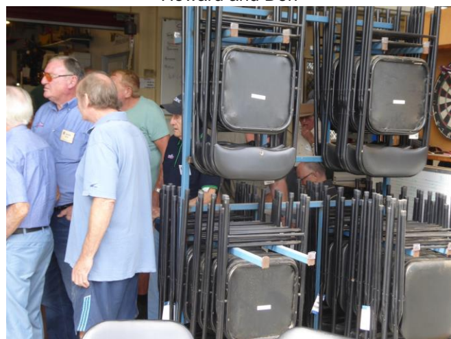
We were impressed with their chair rack