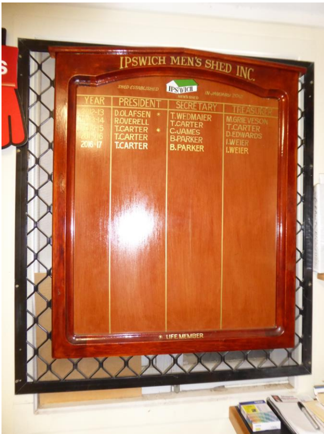
Honour Board. Ipswich kindly donated one to Shed West which will need to be installed at Kenmore in a "clean" environment.