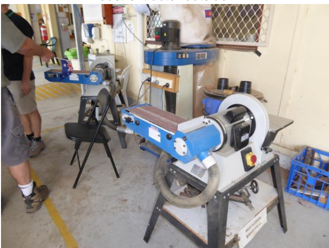
Belt Sanders with own dust extraction