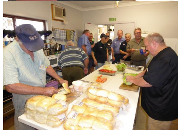
Air Conditioned Computer and Food Prep room