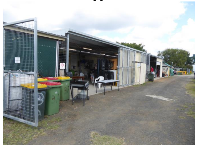
The Shed and driveway