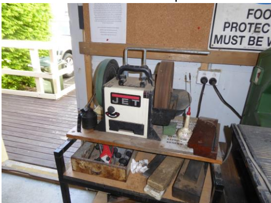
Tool sharpener – a very good one.