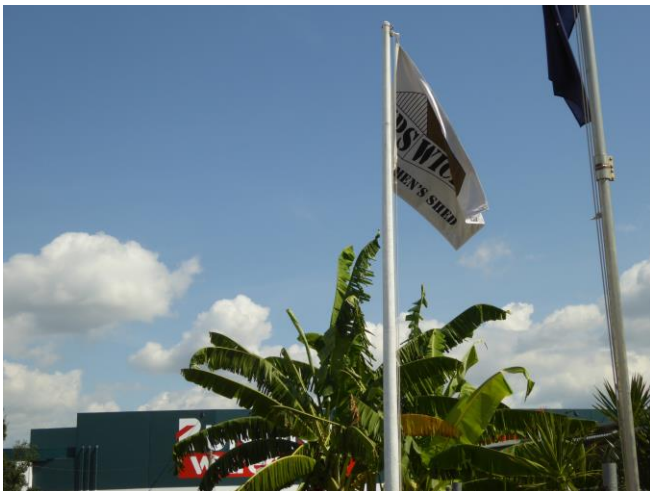
They had a flag made up in Sydney, which is something we should do (when we get a pole!)

This is what Men's Sheds are all about. Working together for the greater good of our movement, and those who are members of it.