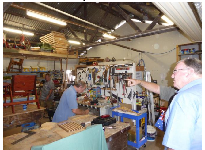
Wood working bay