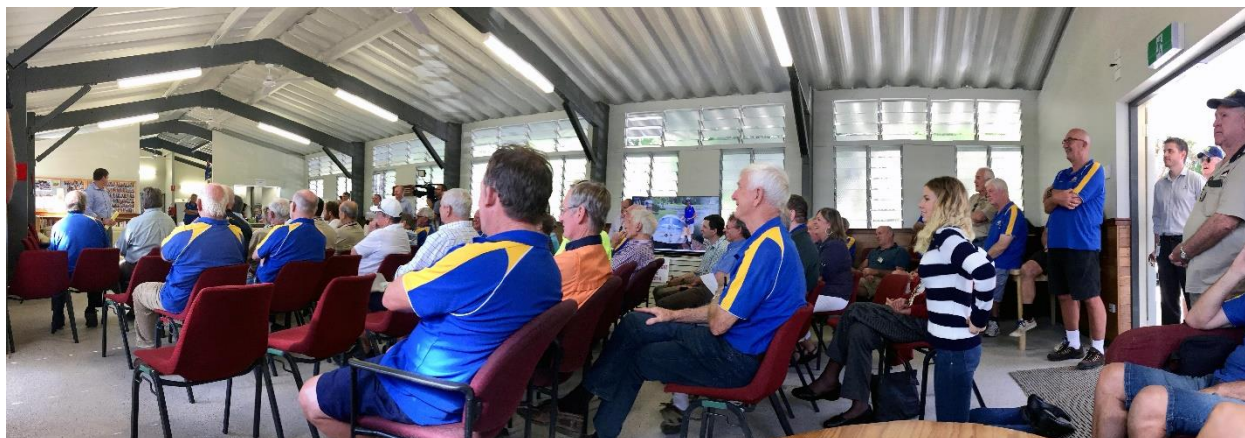
Mr Llew O'Brien MP referring to the "Australia's Most Wanted" gallery at the opening of the Long Shed at Noosa on 29 June 2017.