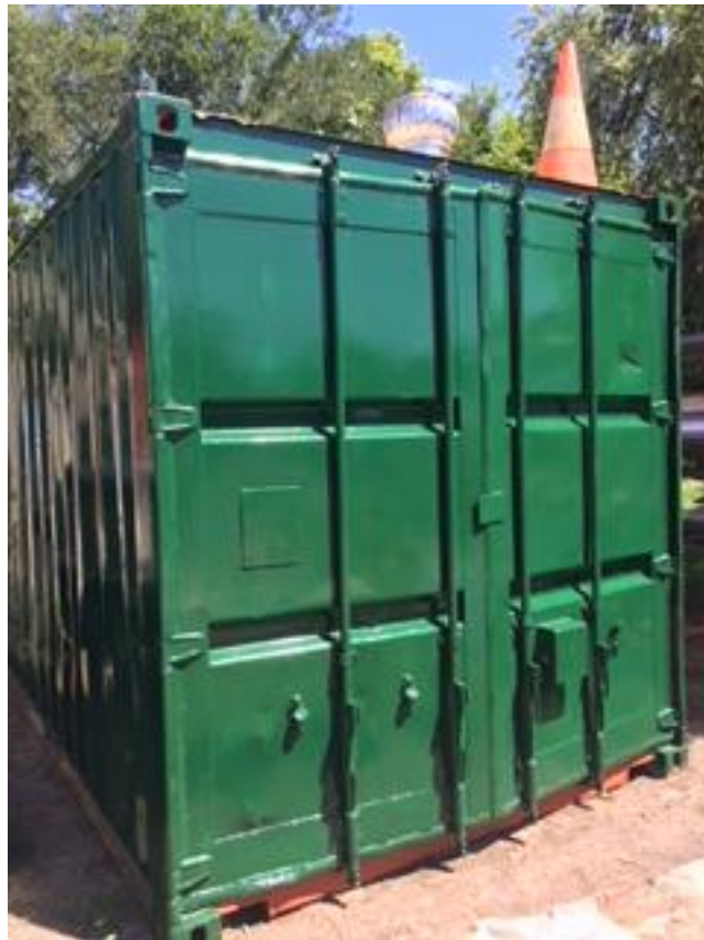
Container painted - thanks guys!