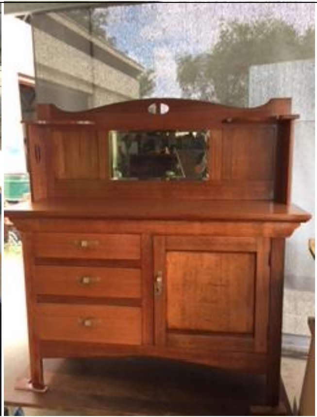
Gary completes another great job !