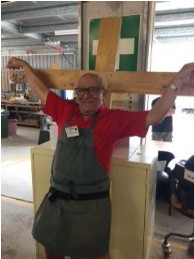
WE ALL HAVE CROSSES TO BARE!!!