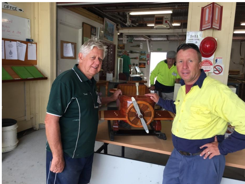
AMBERLEY AIR BASE MUSEUM THANK IMS FOR THE WOODEN PLANE