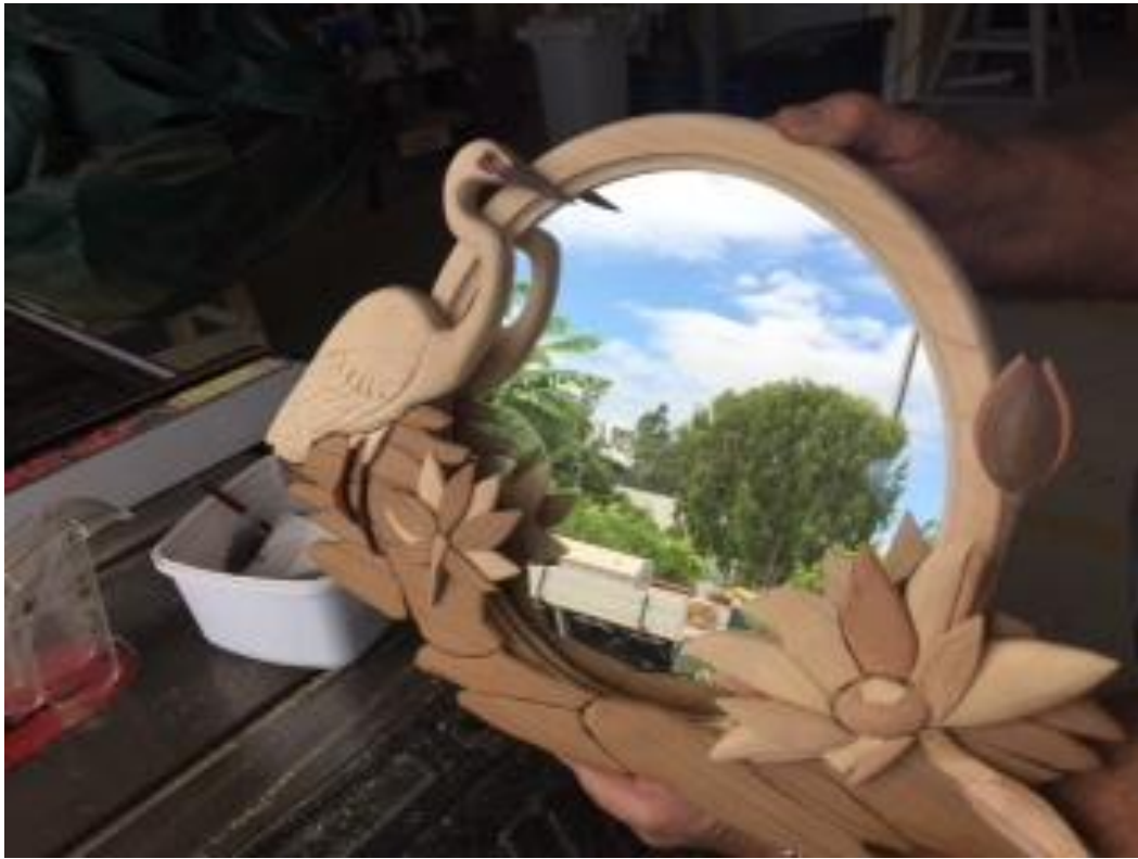
WONDERFUL WORK KIM!