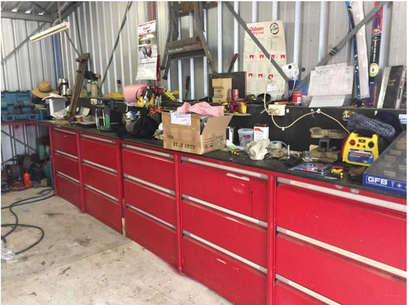
New cabinets coming soon for store room Thanks to Karron Baker