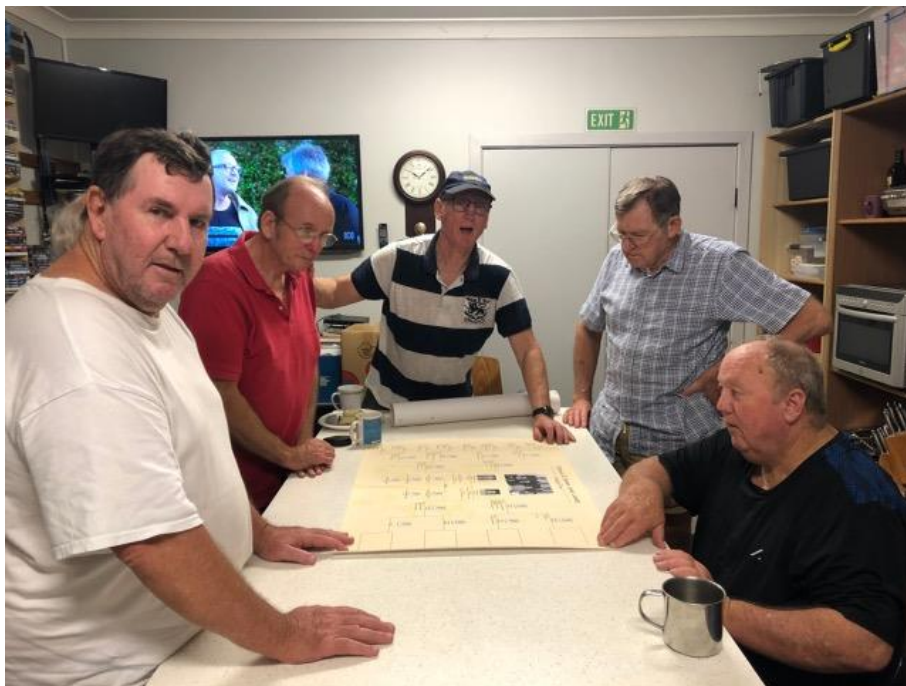
DAY 3 SAW MEMBERS ENJOY DISCUSSIONS ON FAMILY TREE AND DNA. WHILE PLAYING CARDS AND EXERCISE PROGRAM CONTINUED.

All present also agree that having the day “fortnightly” works better than making it weekly. If we can maintain numbers around the 10 mark in the future then I believe we have a successful venture on our hands.