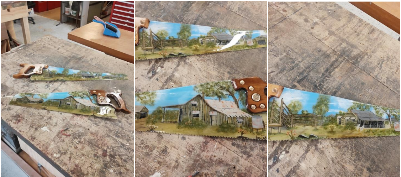
PAINTED SAWS BLADES