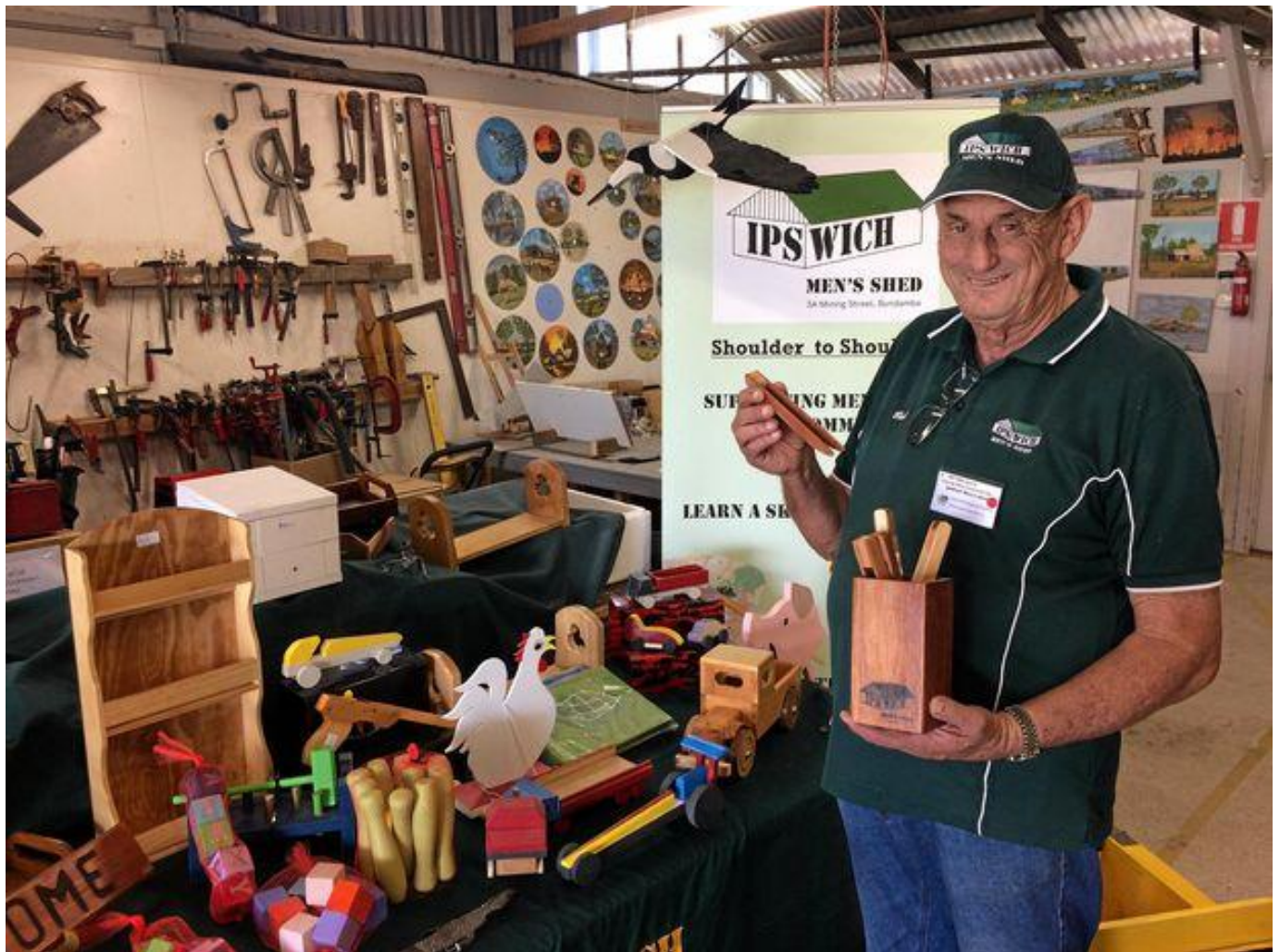
BOB'S PASSION - THE SHED!