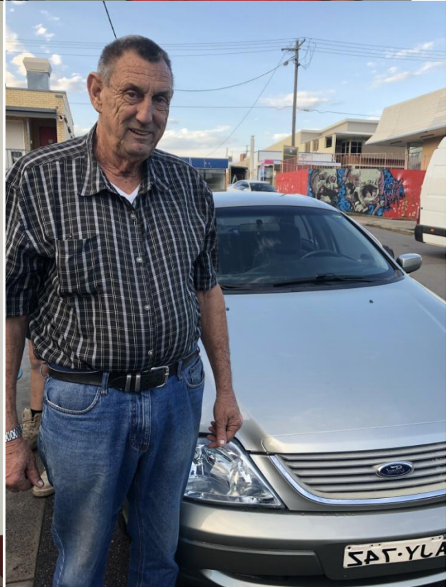
FACES OF BOB!!