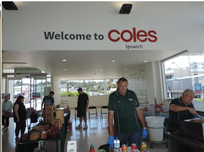
A YOUNG LADY FROM COLES STRUGGLING WITH CANCER- COLES BBQ

BEN FROM COLES IS WITH US TODAY THANKS FOR ALL YOUR SUPPORT