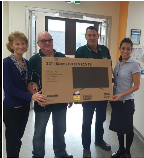
ANZAC DAY –REMEMBERING HIS MUM -- GIFT TO HOSPITAL