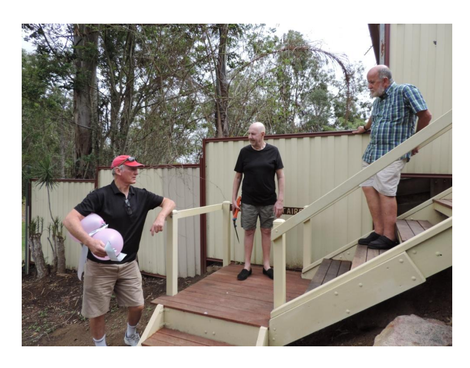
SHOULDER TO SHOULDER