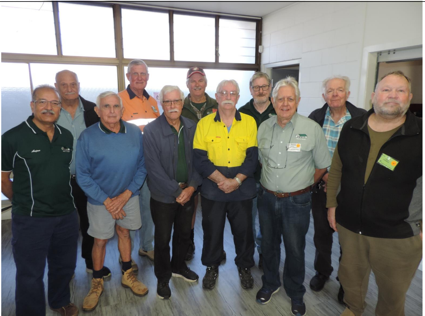
COMMITTEE FOR 2022-2023