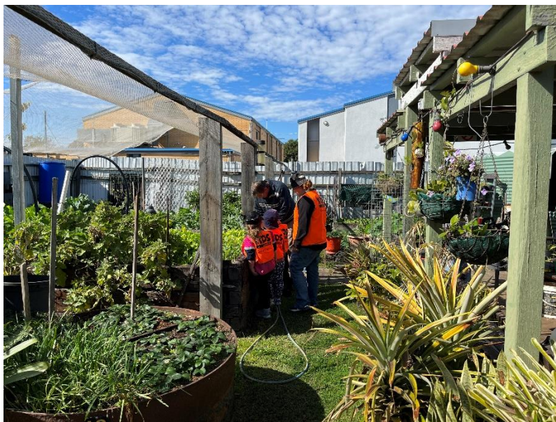
GARDEN GOING WELL-THANKS TEAM!