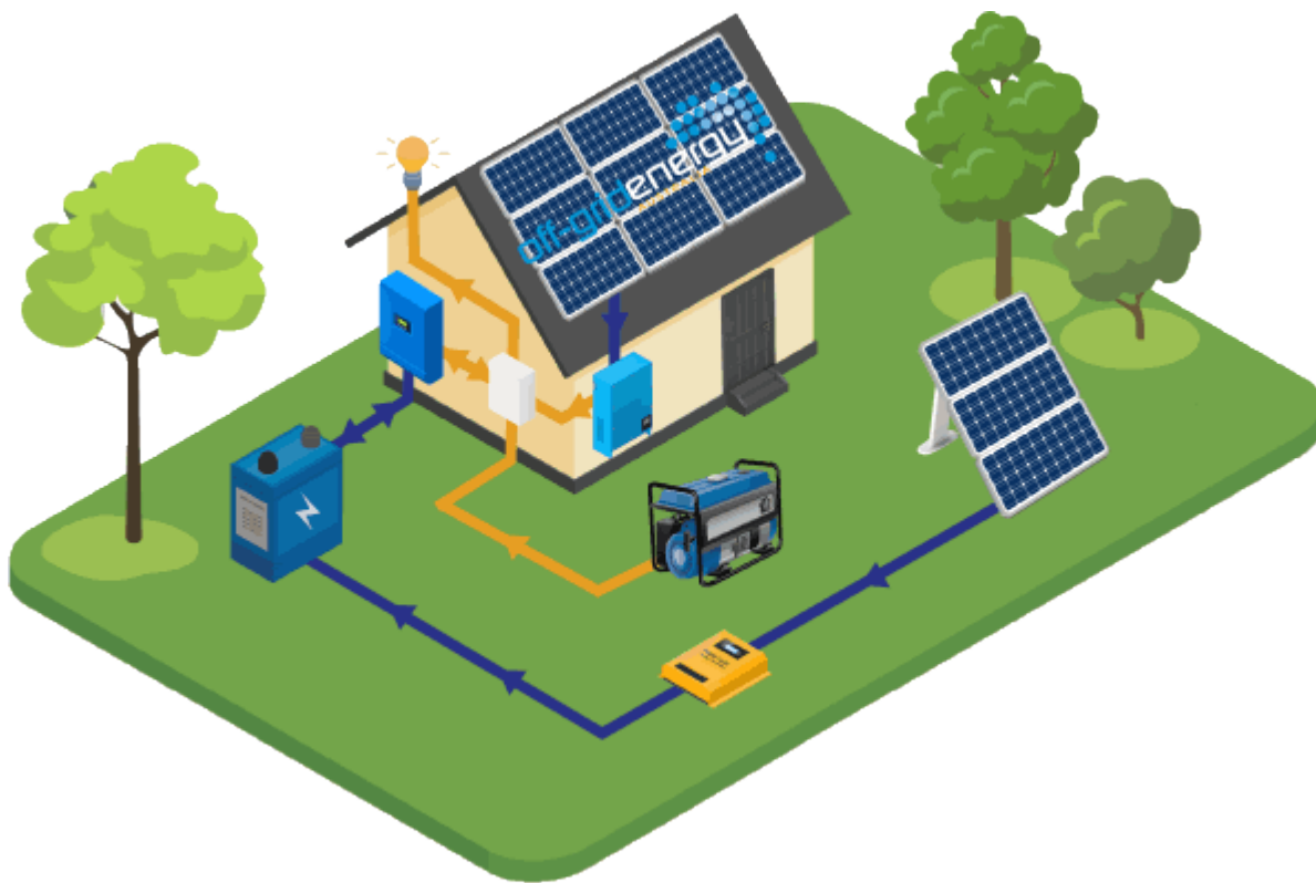
SOLAR SYSTEM FOR THE SHED (COMING SOON)