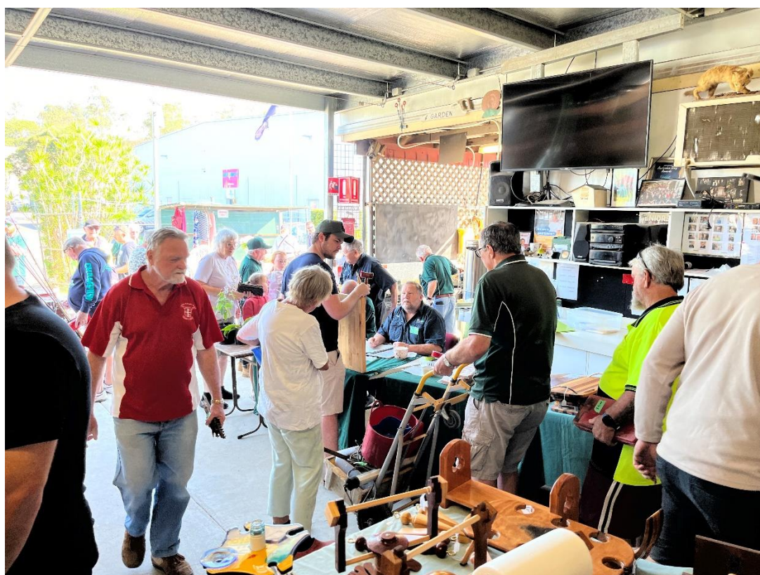
A SCENE FROM OUR GARAGE SALE