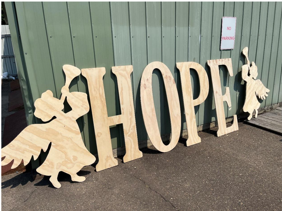
Christmas message from the Salvos!