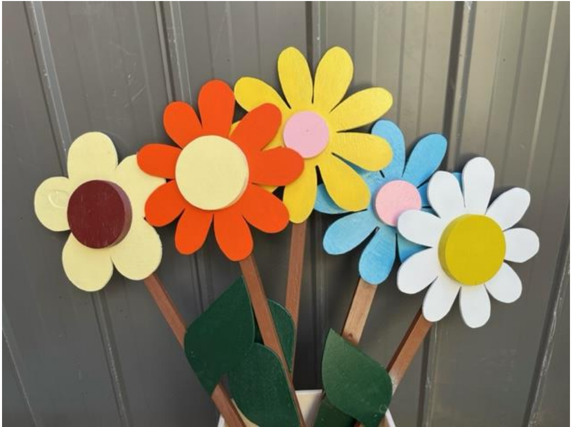
FLOWERS BY BRIAN