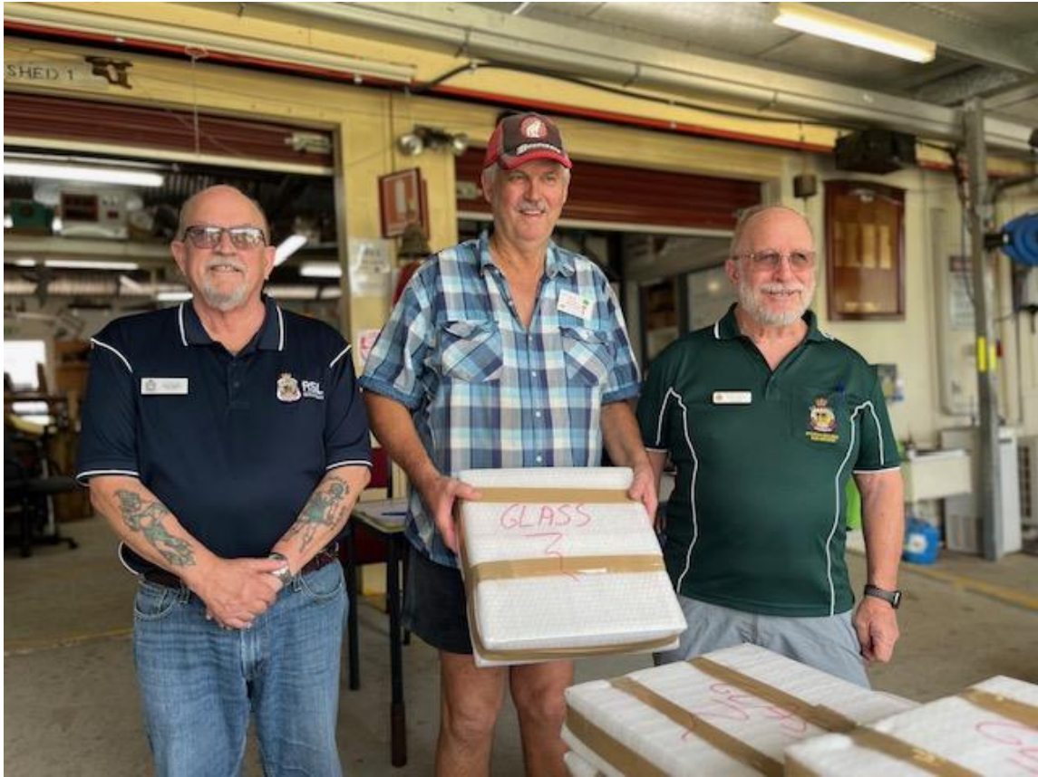
RSL Pick up Rob's Flag Boxes