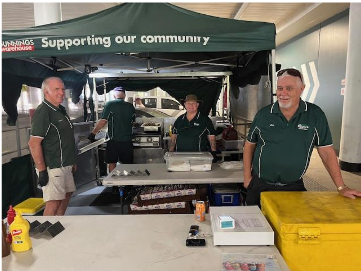
Friendly staff at Bunnings's BBQ